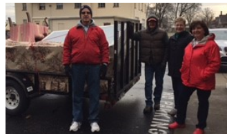
SVDP OUTREACH MINISTRY