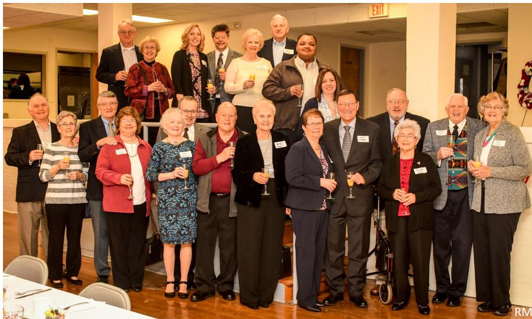
SPECIAL ANNIVERSARIES CELEBRATION